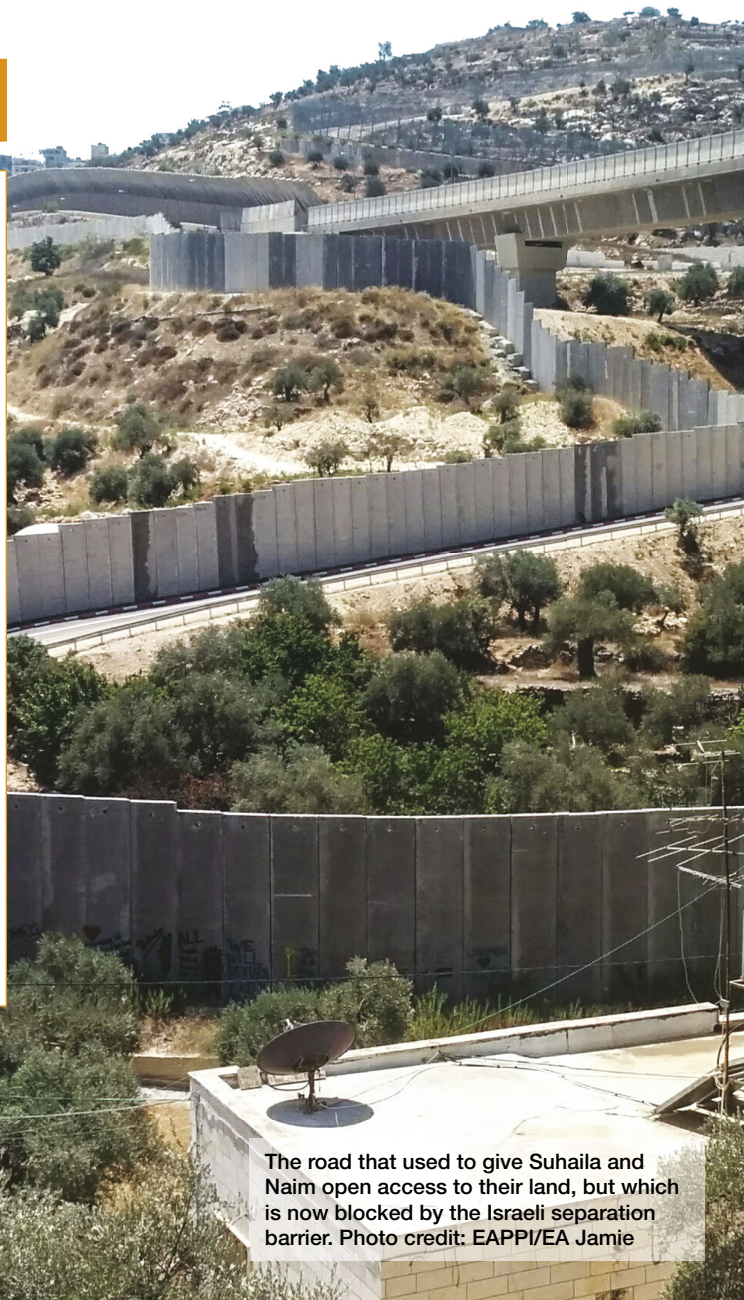
The road that used to give Suhaila and Naim open access to their land, but which is now blocked by the Israeli separation barrier.